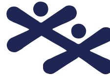
Fort McMurray Boys and Girls Club

The Fort McMurray Boys and Girls Club (FMBGC) is a non-profit, or social-profit agency, and registered charity. We are a member of Boys and Girls Clubs of Canada and have been serving the children and youth of Fort McMurray and Wood Buffalo Region since 1981 by providing a safe and fun place to learn, play, and grow.